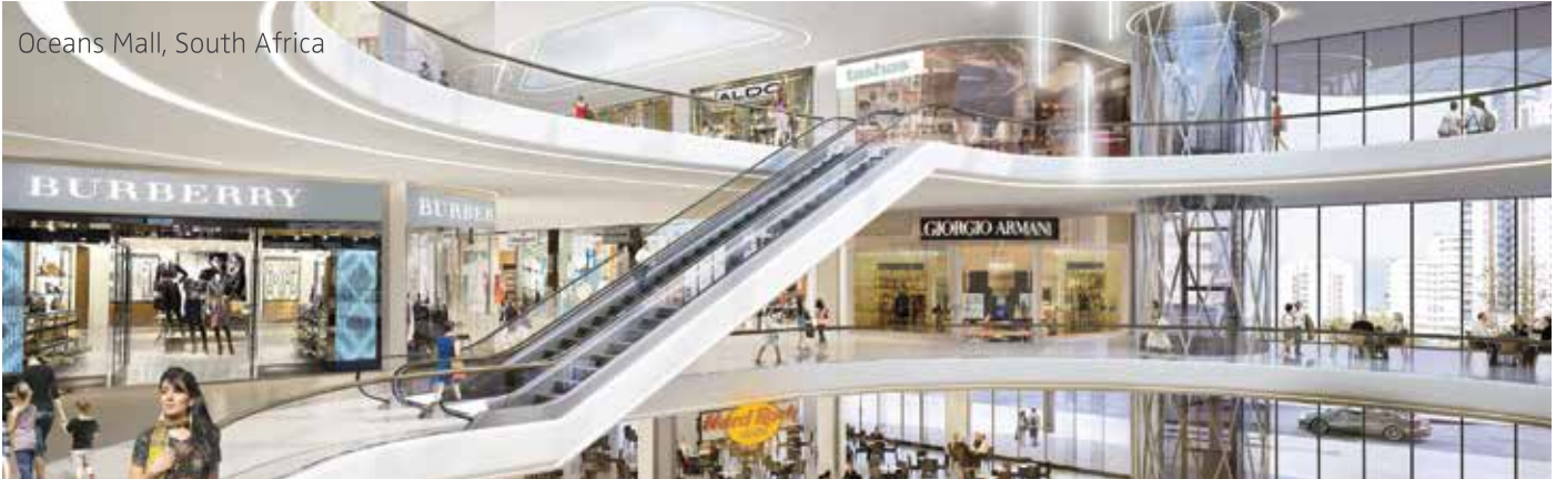
Oceans Mall, South Africa

Project Name: Fourways Mall Location: Gauteng GLA (m²): 85,000 (redevelopment and extension. Total GLA: 170,00m²) Expected Trading Date: April 2018 Anchor Tenants: Relocating and expanding all major national fashion retailers as well as adding new international brands