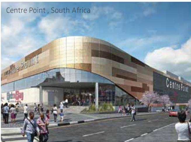
Centre Point, South Africa

Project Name: Emfuleni Mall Location: Free State GLA (m²): 8,000 Expected Trading Date: March 2018 Anchor Tenants: Shoprite