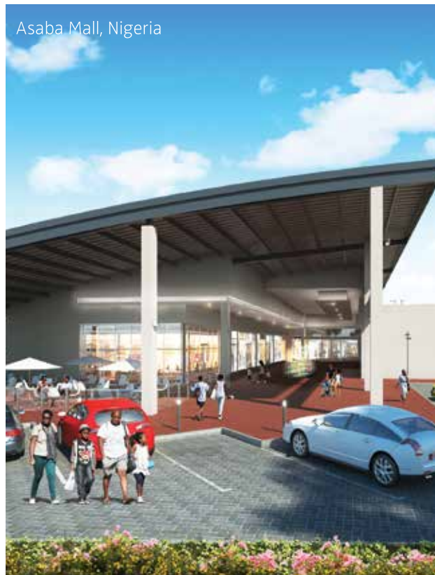
Asaba Mall, Nigeria